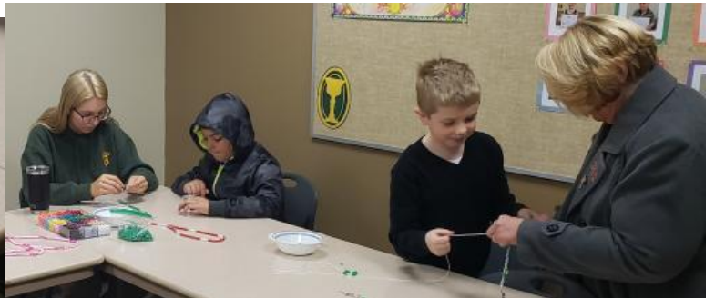
Third graders made rosaries.