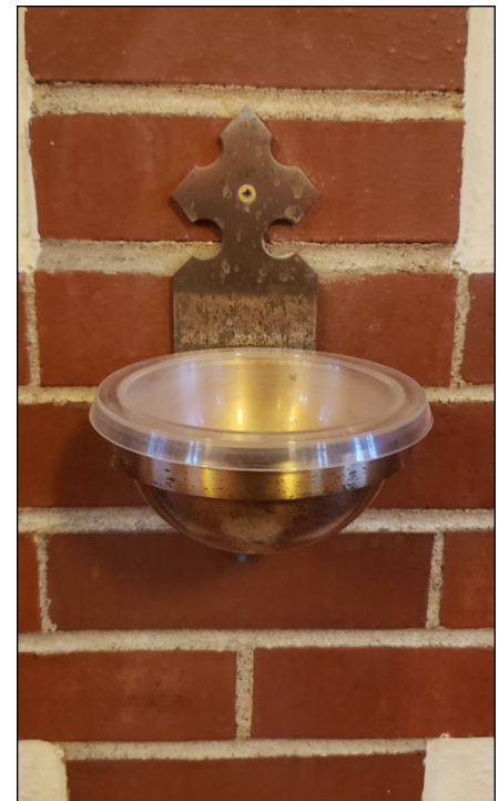
Holy Water Font Holy Water is held here for individuals to bless themselves.