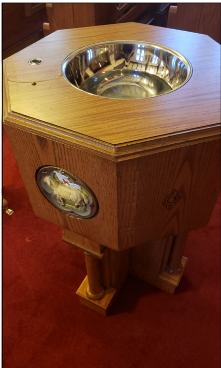
Baptismal Font The font where young children are Baptized.