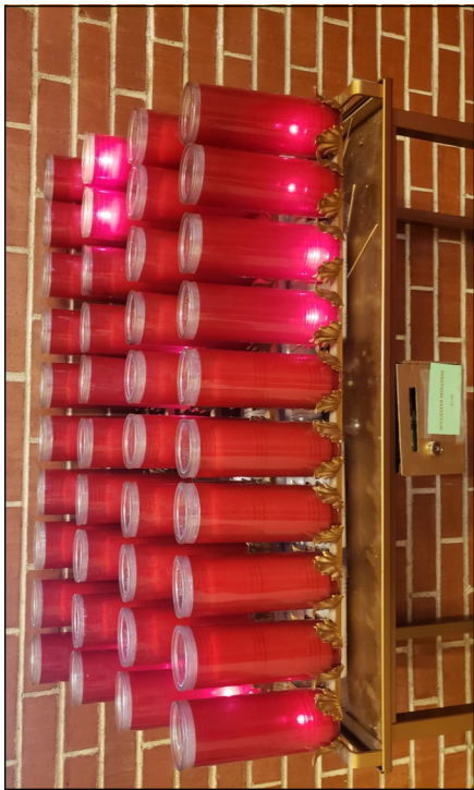
Votive Candles Candles lit to pray for special intentions.