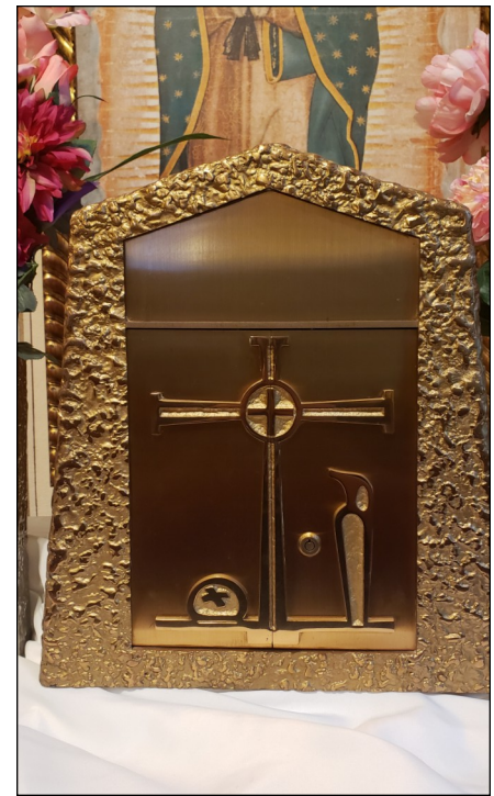
Tabernacle A case made of a solid material, where the Blessed Sacrament is kept in a covered ciborium after Mass.